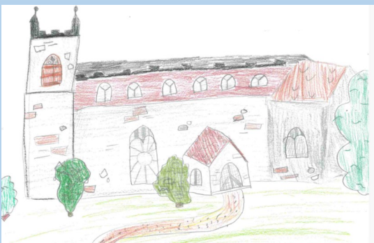
All Saints Church , Hopton